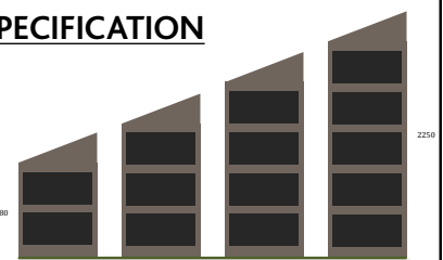
MULTIPLE HEIGHTS COMPLEX Available in 4, 6, 8, 10 double niches